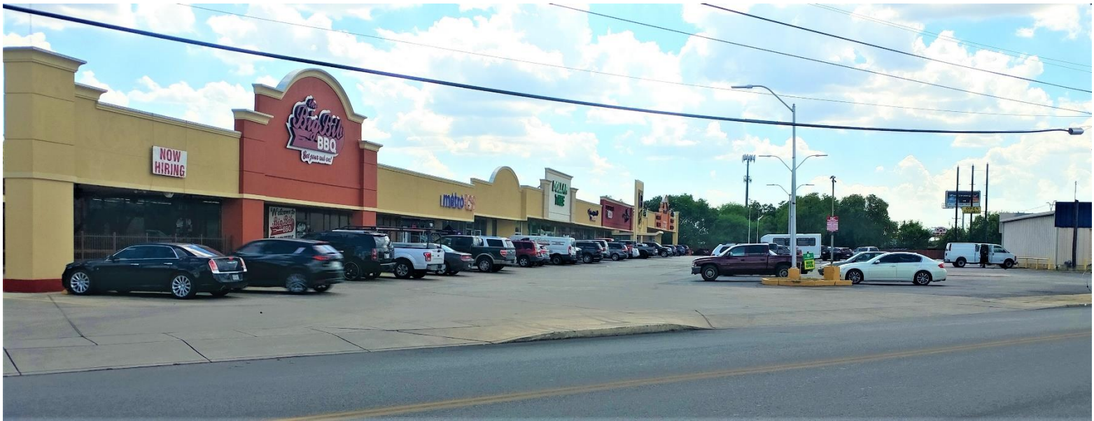
VIEW ACROSS LANARK DR FROM SUBJECT PROPERTY