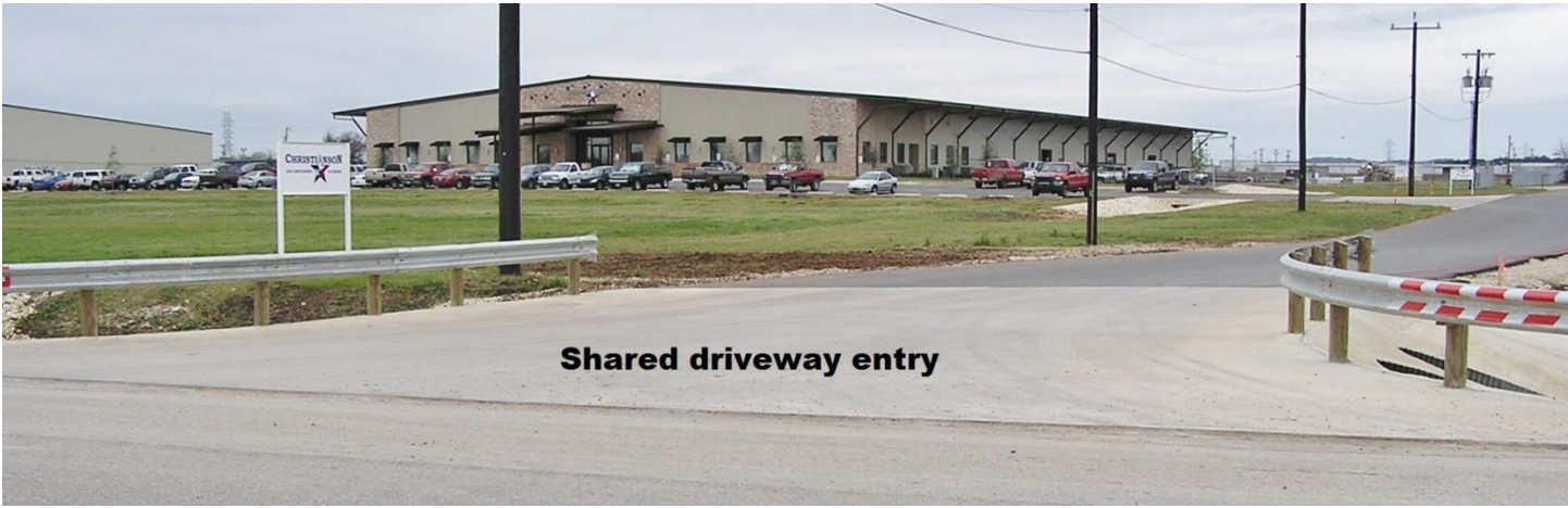
Shared driveway entry